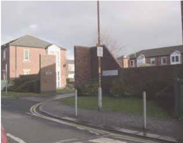
▲ Overlooked shared space with privacy through the entrance walls▼

blocks need to have good natural surveillance of the street with windows and doors facing outwards.