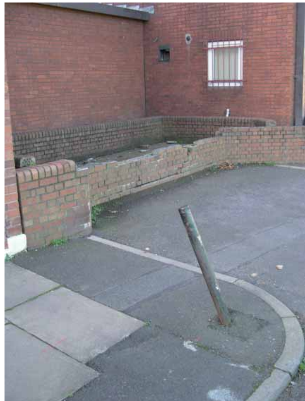
▲ Neglect of the space defined by the low brick wall signals unclear ownership

Where space is not private with defined boundaries, but more open and accessible, ownership of land may be unclear. Anonymity increases and offenders may go unchallenged. Landowners' influence reduces and may be minimal in public spaces.