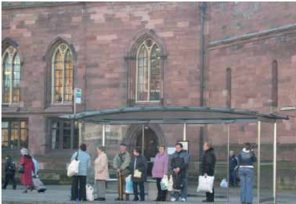
▲ A well placed bus shelter in vandal resistant material which is open to surveillance

Bus stops and shelters should be located so as to have good surveillance in active streets as well as from the highway. They should ideally be located in an area which is generally well lit.