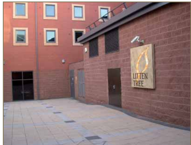
▲ Blank frontages with little overlooking should be avoided.