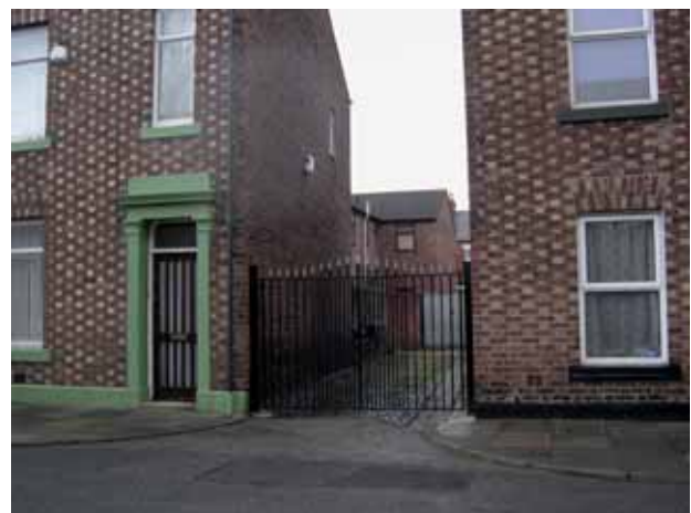
▲ These alley gates effectively deter unauthorised entry to the rears of these properties.

6.32 Alleyways and subways are often narrow, anonymous and poorly overlooked. They may provide access routes for criminals. If there is a need for them, separate from roads, they should be wide enough for the purpose, well lit, direct to places where residents want to go and overlooked by dwellings. They should offer clear sightlines with the end of the path visible from the start. Landscaping should be set back by two metres and should preferably not exceed one metre in height when abutting pavements so as not to obstruct lighting or form hiding places.