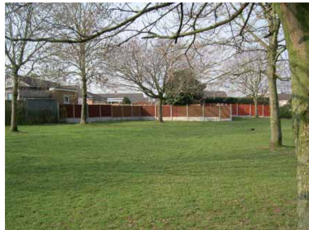
▲ Public space separated from private space by fences and backs of houses.

6.21 A regular maintenance regime of landscaped areas close to buildings, public routes and access points to public spaces is vital if safety and security is being considered. Poorly maintained environments demonstrate neglect and a lack of control. This can increase the fear of crime and act as a catalyst for anti-social behaviour. In urban areas trees and shrubs should, where feasible, have well defined edges, through the use of walls, kerbs and tree grilles.