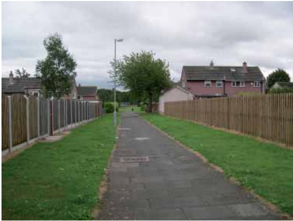
▲ Further pedestrian scale lighting would be beneficial on this footpath