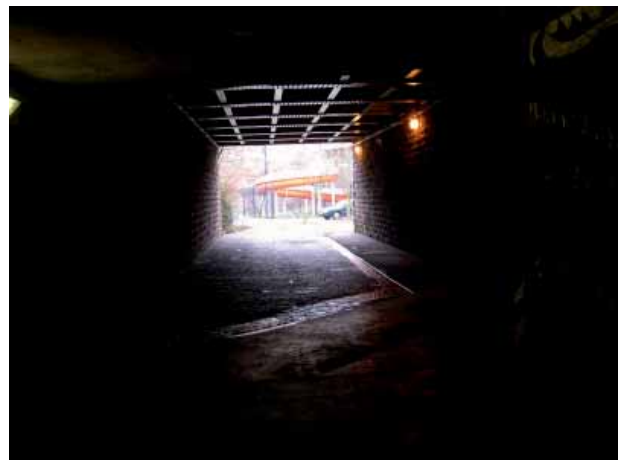
▲ A badly lit subway

circumstances. Low level lighting should be vandal resistant and low maintenance. Developers should ensure that all exterior lighting meets but does not significantly exceed the relevant European and UK standards for both minimum and average illuminance. The minimum UK standards for exterior lighting are set out in BS EN13201 and BS 5489. Lighting associated with sports pitches will require a lux plan with a planning application to show the spread and direction of illumination.