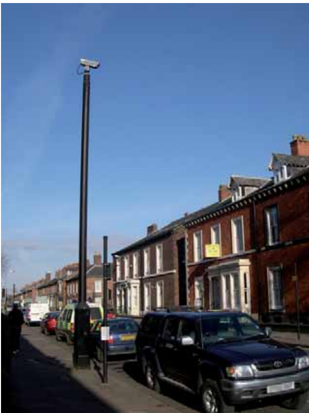
▲ An obtrusive CCTV camera column

Landscaping and lighting should be considered together to ensure that tree growth does not obscure lighting and create dark patches.