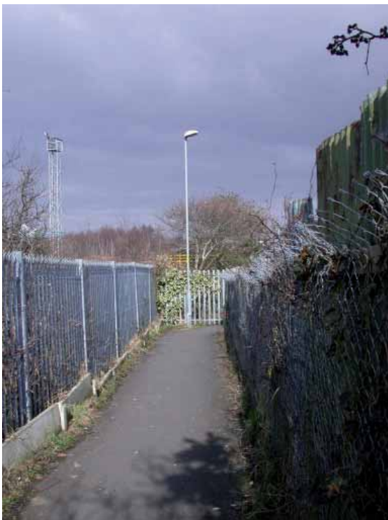
▲ An indirect unoverlooked footpath which has corners which could prove dangerous

possible or considered necessary a physical or symbolic threshold should be incorporated to indicate the boundary between the public domain and the estate. All access routes should be overlooked to maximise natural surveillance. External storage areas should be designed to prevent unauthorised access with appropriately specified fencing and rear service areas should preferably be overlooked and have lockable gates to ensure security. Welded mesh or extruded metal fences are more secure than palisade types.