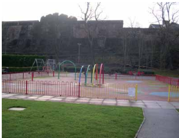
▲ A safe, attractive play area for young children