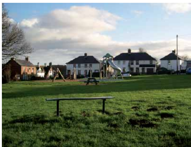
▲ A well overlooked, popular children's play area

visible and conveniently located. Children's equipment should be robust, vandal resistant and appropriate for the intended age group. Play areas for young and very young children should be sited within the built community, to provide the opportunities for natural surveillance and supervision but not too close to cause noise disturbance.