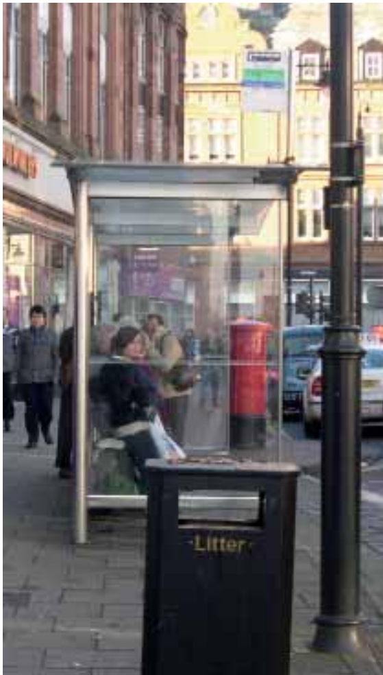
▲ A bus stop well sited close to the centre

Ensure effective lighting at a human scale including to entrances and restricted or enclosed pedestrian routes.