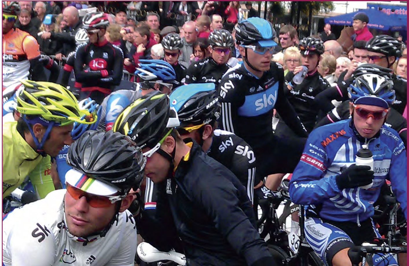
Tour of Britain, Carlisle Stage Start 2012