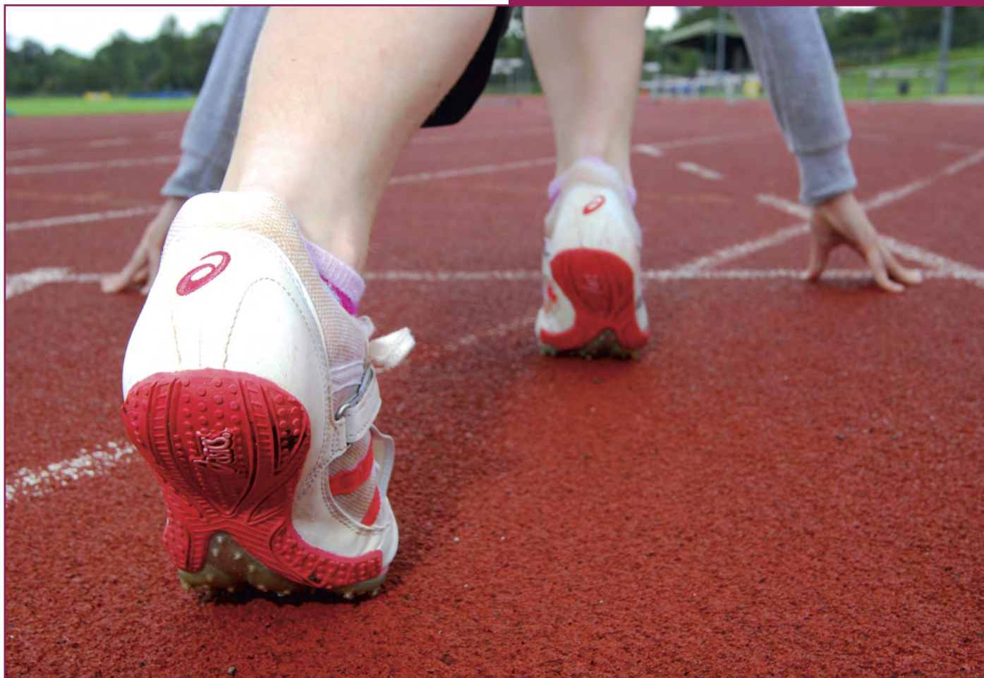
The Sheepmount running track