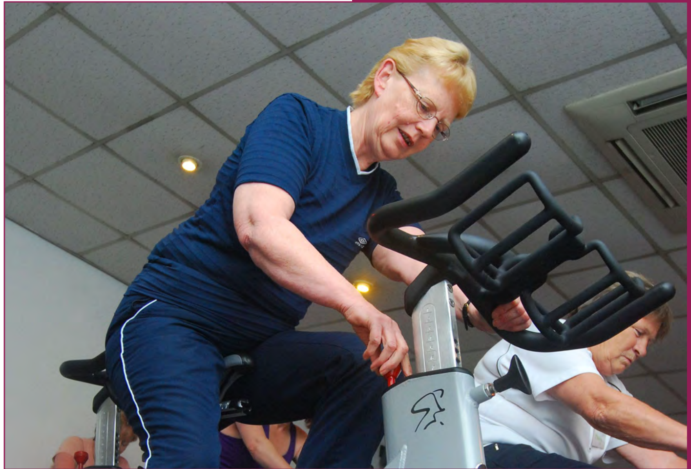
Spinning at The Sands Centre