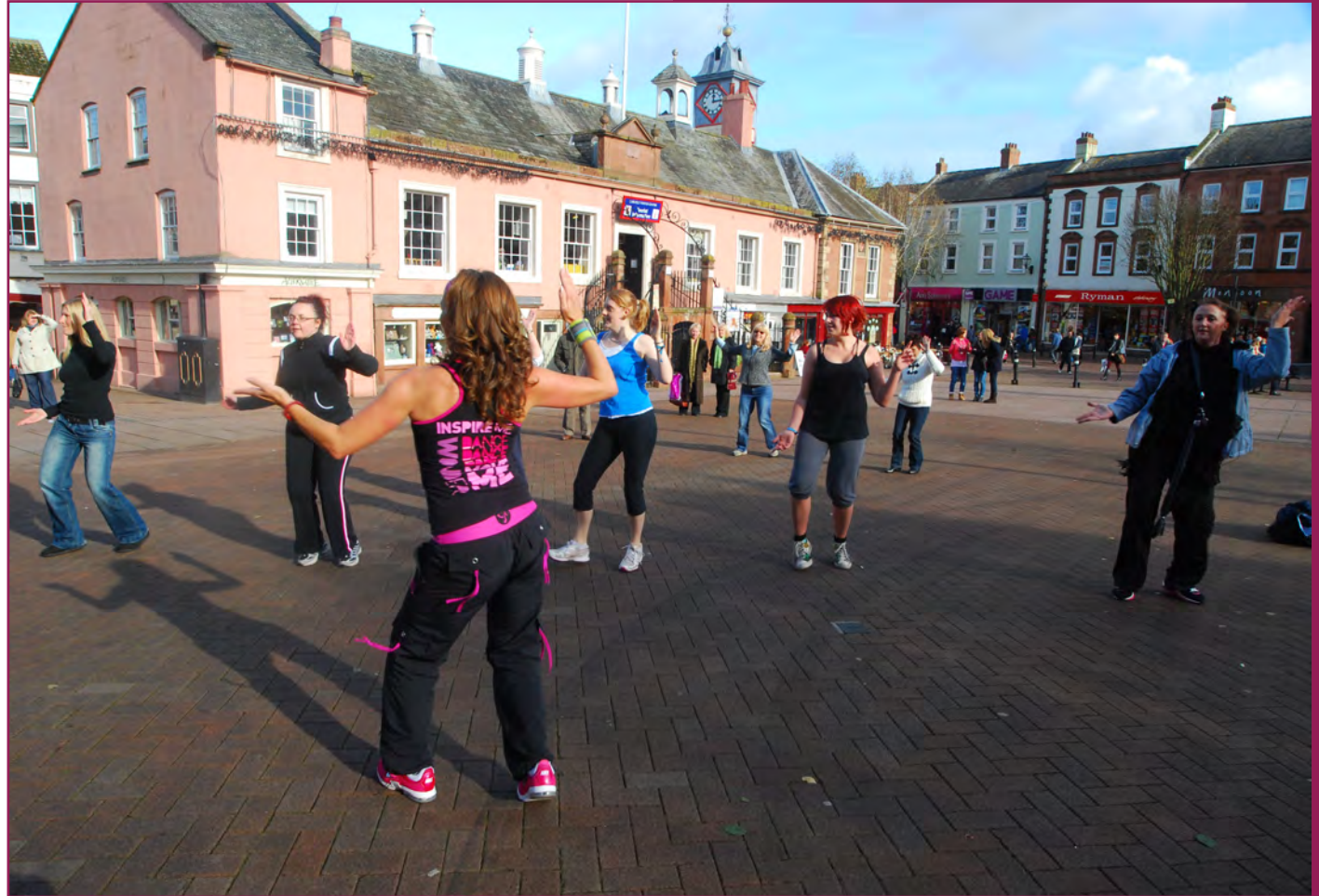
Zumba in the city centre

While average educational standards are comparable with the average for the North West region and average levels of unemployment are relatively low across the district, there are geographical concentrations across some of Carlisle's urban wards and pockets in the rural areas where levels of educational achievement are low and levels of unemployment are high. Although the University of Cumbria attracts students to Carlisle, high level qualifications are still less prevalent and average earnings are relatively low.