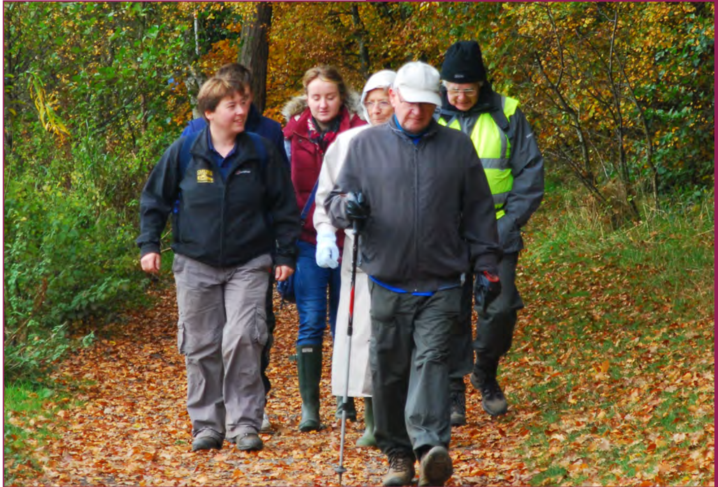
A Talkin Tarn guided walk

Throughout this process we will strive to be passionate, fun, innovative, consistent, creative and accountable.