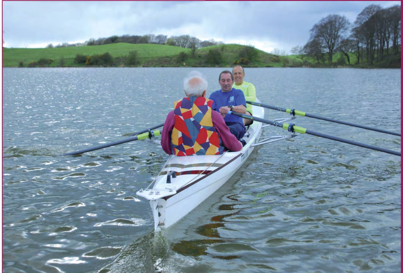
Rowing on Talkin Tarn

We recognise the need to develop and support active citizenship. We want our communities to be strong and vibrant as these are important to the quality of life of local people. A demonstration of this belonging is volunteering, which is a key contributor to achieving social cohesion objectives and aligns well with the coalition Government's 'Big Society' agenda. Sport makes the largest single contribution to total volunteering in England, with 26% of all volunteers being involved in sport. Sport contributes in the drive to deliver cohesive communities by demonstrating greater emphasis on supporting 'pro-social' behaviour, which is a positive step forward.