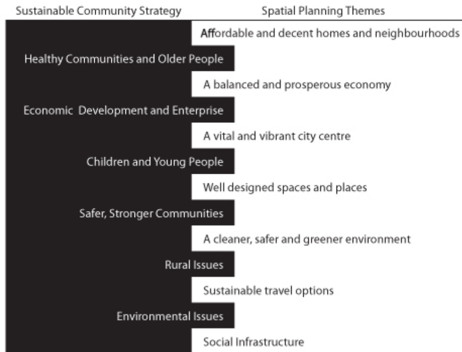
Diagram 1 An Integrated Approach to Sustainable Community and Spatial Planning