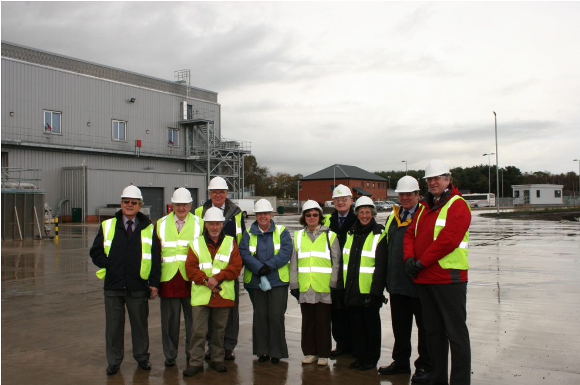
Members of the Environment & Economy Overview and Scrutiny Panel accompanied by the Mayor and Mayoress visit to The Northern Resource Park at Hespian Wood October 2011 which included a tour of the Mechanical Biological Treatment (MBT) plant.

The sections below give a personal commentary from the Chairs of the Panels on their view of their particular Panel's work over the last year.