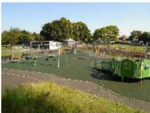
Hammonds Pond Infants and Junior Play Area