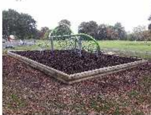
Chances Park climber