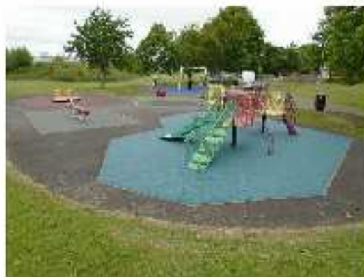
Hunters Crescent Play Area