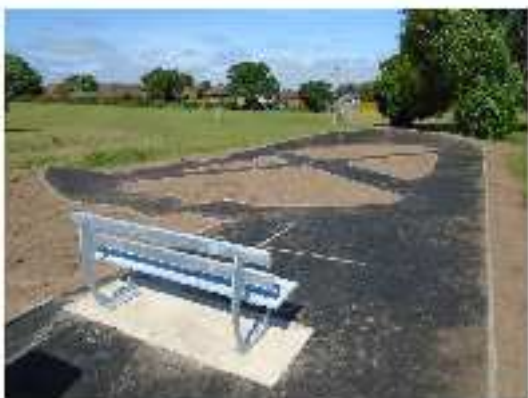
Dale End Field BMX track