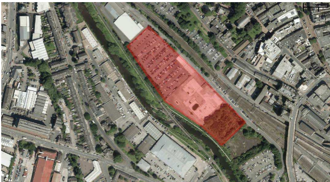
Figure 1: Caldew Riverside site area.