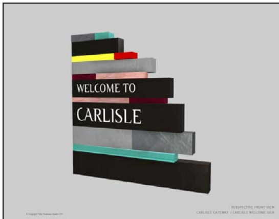
Gateway sign (stone)