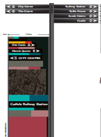
Combined information point/finger post