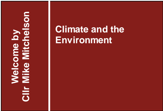
Centre Pages x 4