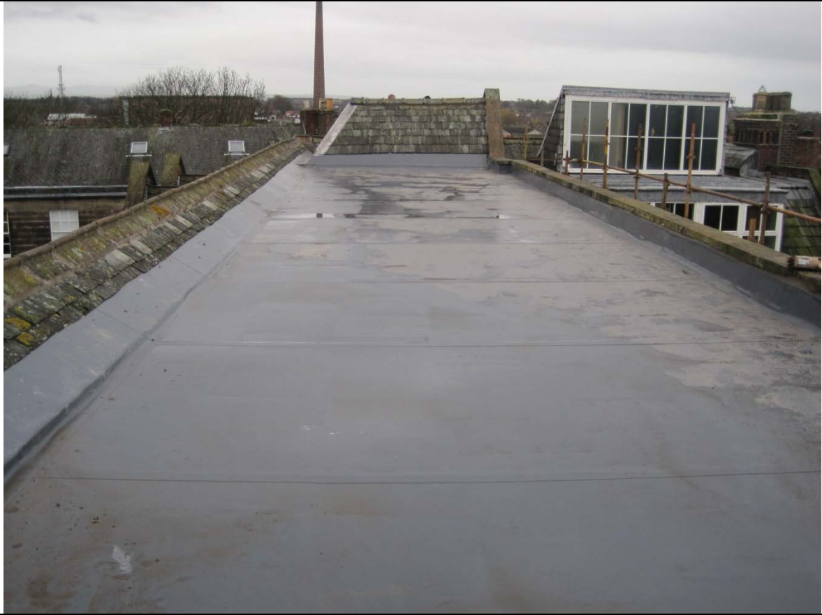
AFTER – Looking south