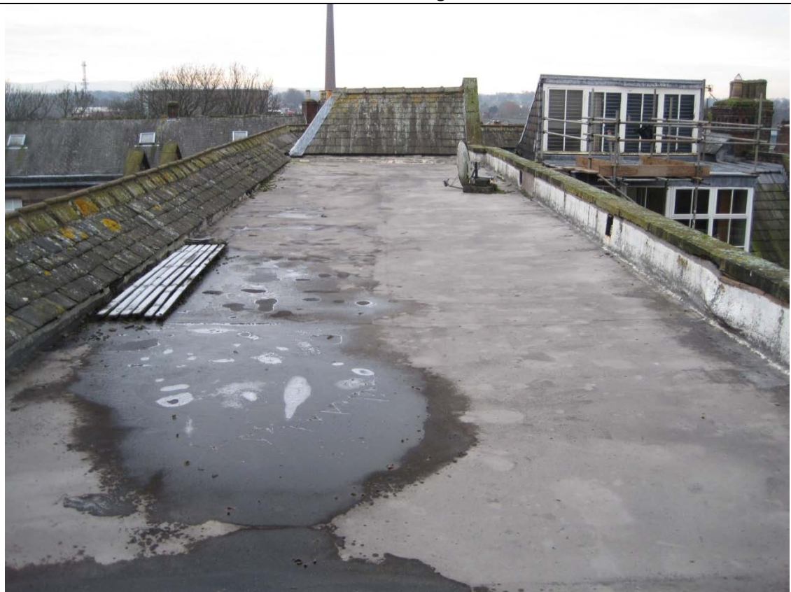
BEFORE – Looking South