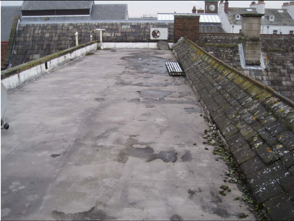
BEFORE – Looking North