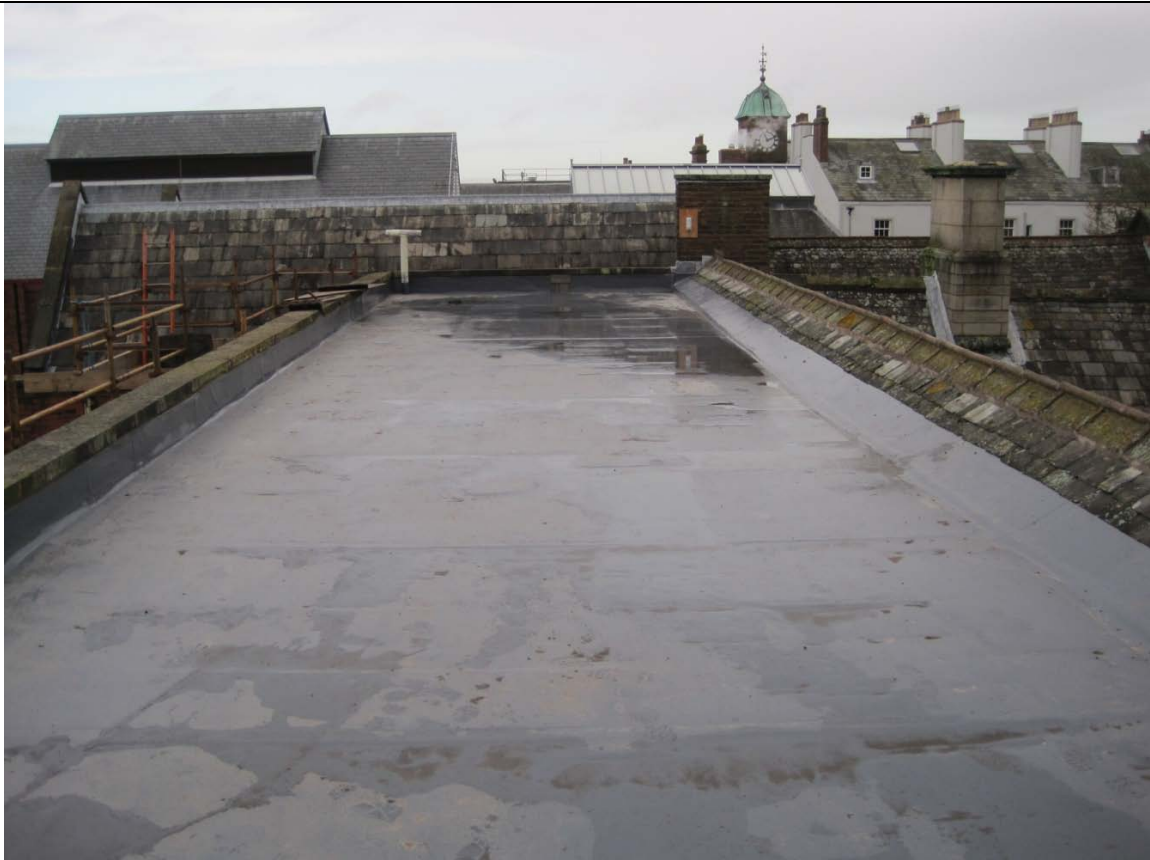
AFTER – Looking north