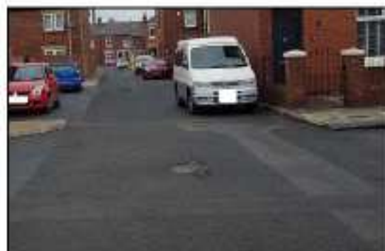
Broken out carriageway