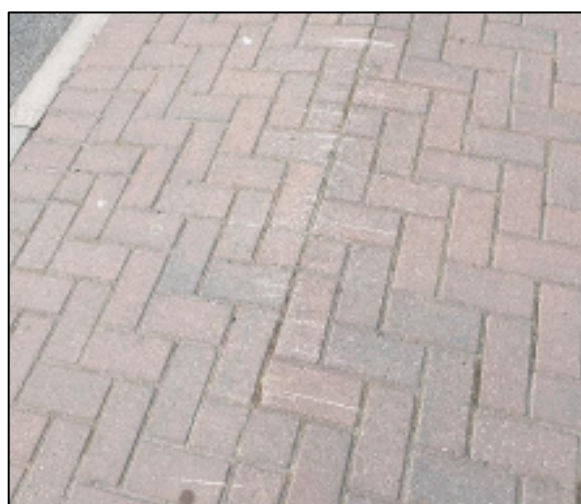
Scratch marks on the speed hump